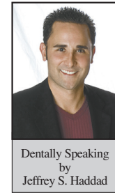
Dentally Speaking by Jeffrey S. Haddad

There are numerous procedures that are provided by dentists, but not all dentists offer the same services. Whether you are looking for a specific procedure like tooth-colored fillings, same-day crowns (CEREC), root canals or just a practice to maintain your present dental health, it is important to be aware of all services your potential dental office provides. For instance, some dentists