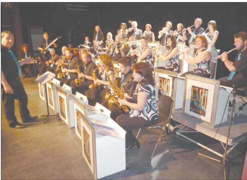
The French Jazz Band EMIJ Elbeuf will perform as part of the Blue Lake International Exchange Program. Host families are still needed.

Host families are needed to house these French guests Aug. 5-8. The group is composed of about 25 musicians, mostly adult couples and a few teenagers. Host families are responsible for transporting musicians to their scheduled performance on Aug. 6 in downtown Lake