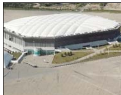
Sound Off callers comment on Silverdome deal.