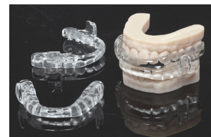
Figure 1: Custom Sleep Apnea Appliance

Sleep apnea is a life-threatening medical condition and needs to be properly addressed. Treating sleep apnea isn't just about reducing numbers on a sleep study, it's about restoring your energy, protecting your long-term health, and improving your quality of life. Our snoring and sleep apnea patients tell us that our sleep appliance changed their lives. If you are suffering from poor sleep quality, you also deserve options that truly work for you.