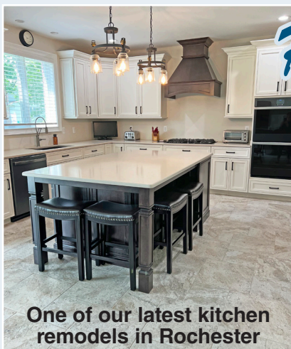
One of our latest kitchen remodels in Rochester

Serving the Rochester area for OVER 40 YEARS!